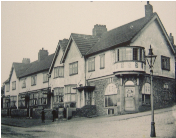
10 34 to 48 Rochdale Road (1898)

Look at Redcroft & Fencegate and compare them with Briarhill adjacent. The change in style is striking. Redcroft & Fencegate are asymmetrical and have a much lighter feel, pointing towards the Twentieth Century. In contrast Briarhill is heavy and Victorian. Yet, there are common features too. Each design relies on a large gable and both have the motif of a bay window breaking the eaves topped by a dormer. On Fencegate the bay is vernacular in style while on Briarhill the bays have very tall Art Nouveau pilasters. When seen together from the south, the houses form an expressive twosome, the larger red building acting as a backdrop to the later white one.