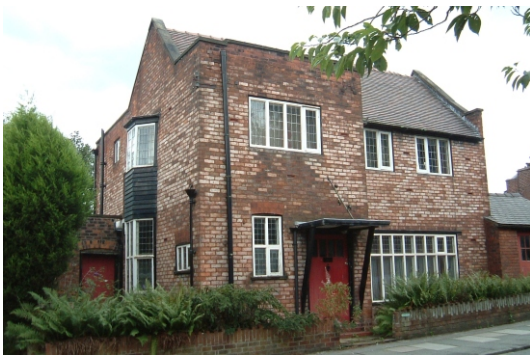
8 Arkholme, 1 Towncroft Avenue (1901)

Edgar Wood entered into a creative dialogue with J. Henry Sellers around 1904. The result was a new phase and the some of the earliest Modern Movement architecture in Europe.