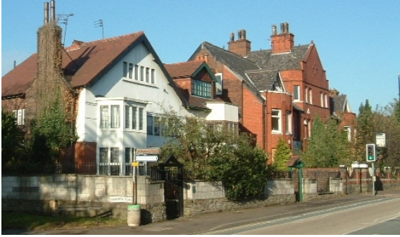
6 Redcroft & Fencegate and 7 Briarhill, Rochdale Road

Look at Redcroft & Fencegate and compare them with Briarhill adjacent. The change in style is striking. Redcroft & Fencegate are asymmetrical and have a much lighter feel, pointing towards the Twentieth Century. In contrast Briarhill is heavy and Victorian. Yet, there are common features too. Each design relies on a large gable and both have the motif of a bay window breaking the eaves topped by a dormer. On Fencegate the bay is vernacular in style while on Briarhill the bays have very tall Art Nouveau pilasters. When seen together from the south, the houses form an expressive twosome, the larger red building acting as a backdrop to the later white one.