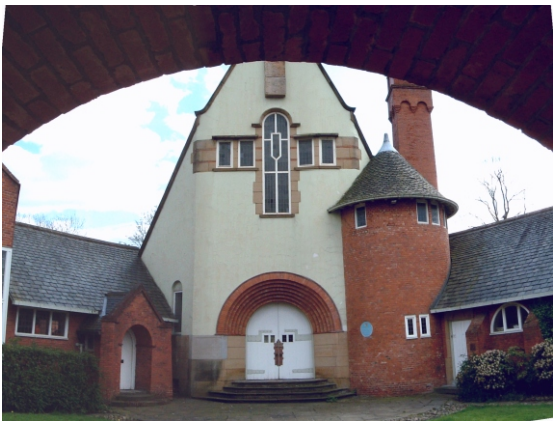
Art Nouveau - First Church of Christ Scientist, Manchester 1903