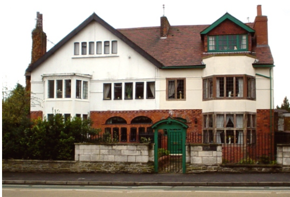
6 Redcroft & Fencegate (1891)

Two of these romantic "white" buildings can be found in Middleton town centre. His very first, Redcroft & Fencegate [6] (1891), and one of his last, a shop and seven houses, 34 to 48 Rochdale Road (1898) [10] opposite.