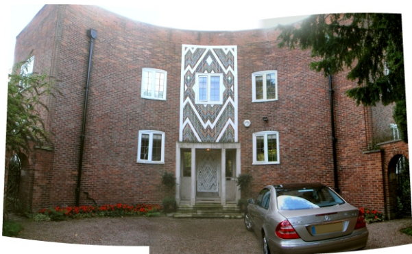
Early Modernism - Royd House, Hale, Cheshire 1914

At the height of his fame, Wood worked with an Oldham architect, J. Henry Sellers, and created a series of radical new buildings of a type unseen before. With their flat reinforced concrete roofs and sometimes geometric patterns, they were among the first examples of "modern architecture" in Europe.