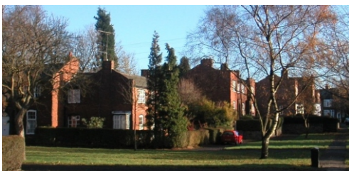
Town Planning - Broadway, Droylsden 1913-1920