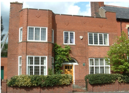
5 36 Mellalieu Street (1910)