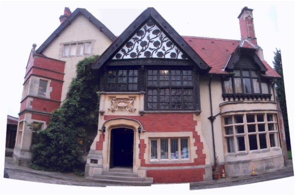
Arts & Crafts Romance - Halecroft, Hale, Cheshire 1890